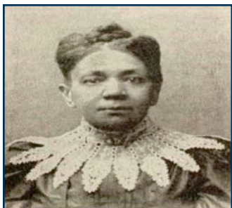
Fanny Jackson Coppin